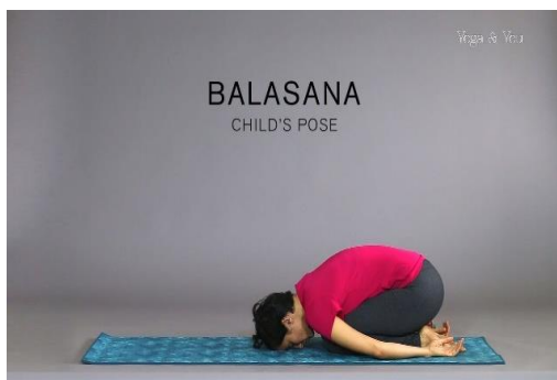
Fig. 1 Balasana or Child's Pose

big toes touching. Extend your arms in front of you and lower your torso between your thighs.