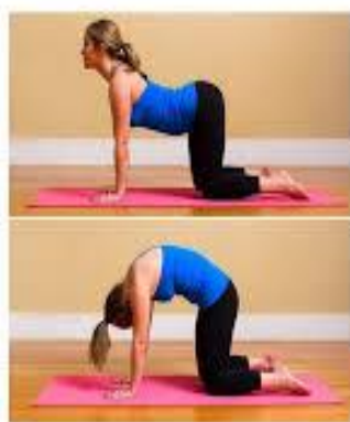
Fig. 2 The Cat-Cow Stretch (Bitilasana- Marjaryasana)

First, get on all fours. Exhale while arching your back (cat) and inhale while arching your back (cow).